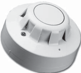
MID-65I Ionization Smoke Detector