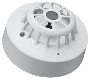
MHD-65-135 Heat Detector