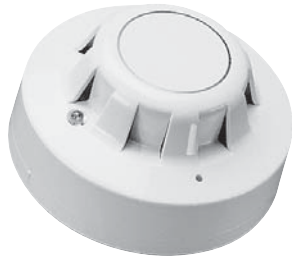
MPD-65P Photoelectric Smoke Detector